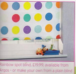
Rainbow spot blind, £19.99, available from Argos - or make your own from a plain blind

and play games on the floor, but if you have floorboards think about soft squishy rugs to chill out on. Homebase have great rugs and Allied carpets have reasonably priced carpet, too. Try and avoid creams or beige carpets - as they're boring and are for adults only - look for soft powder blues or lilacs for a neutral girl/boy compromise. Offer to do chores around the house, car washing or stacking/unstacking the dishwasher (always a good way to plea bargain in our house) to offset the cost of new things in the den.