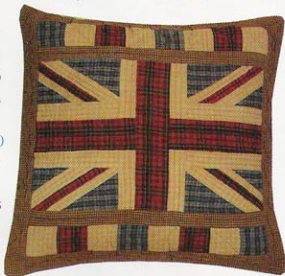
Union Jack flag cushion, £24, available from www.oldeglory.co.uk , or call 08456 528 567

A few soft blankets or throws will make it more 'yours' and you can add masses of inexpensive cushions too, I like the Union Jack ones that are around at the moment, or the one's with the American flag on. Olde Glory do some really nice ones...