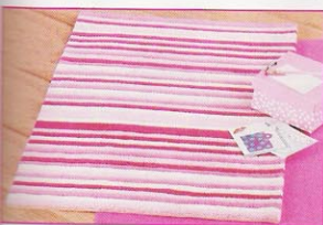
Pink striped handmade rug, £14.99, available from Homebase