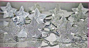
20 star LED chain lights, £9.99, available from Argos